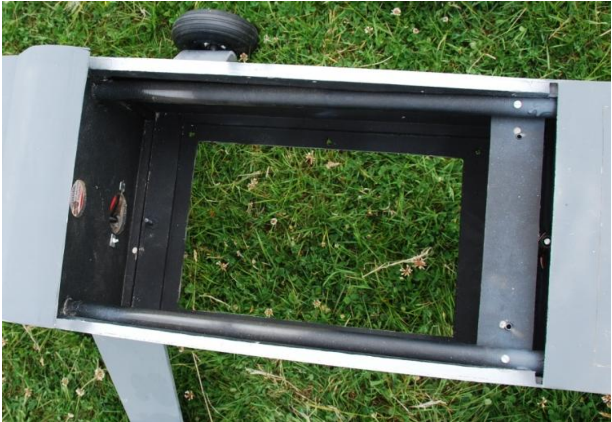
The InView has a large payload bay in the fuselage under the central wing section.